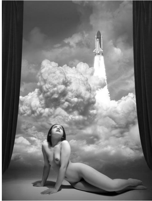
Clouds (Lift Off)