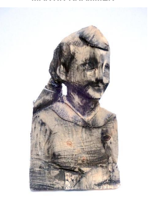
Spruced up (H) Watercolor on spruce 16 7/8 x 7 7/8 x 1 4/7 in. (43.00 x 20.00 x 4.00 cm)