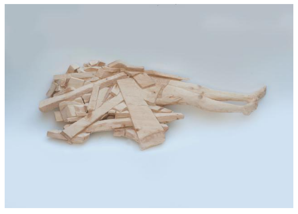
The hill Watercolor on spruce 16 1/2 x 41 1/3 x 2 3/4 in. (42.00 x 105.00 x 7.00 cm)