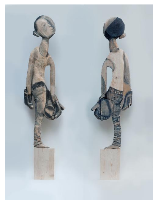
You will never be a real... 2 Watercolor on Spruce 61 4/5 x 15 x 1 3/4 in. (157.00 x 38.00 x 4.50 cm)