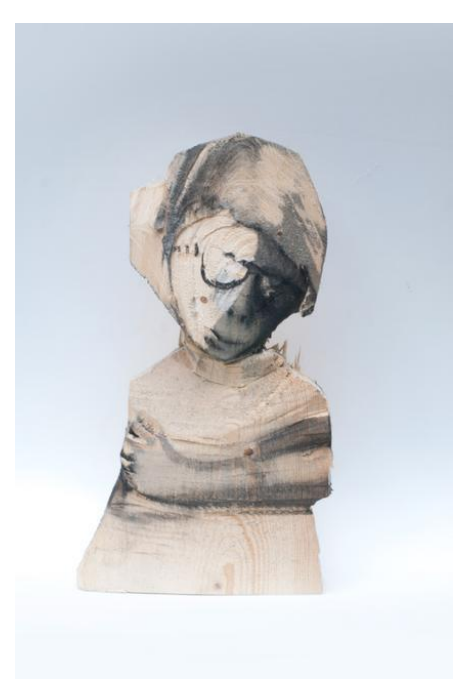
Spruce up (G) Watercolor on spruce 16 7/8 x 7 7/8 x 1 4/7 in. (43.00 x 20.00 x 4.00 cm)