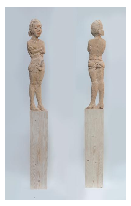
You will never be a real... 3 Watercolor on Spruce 75 1/5 x 7 7/8 x 1 3/4 in. (191.00 x 20.00 x 4.50 cm)