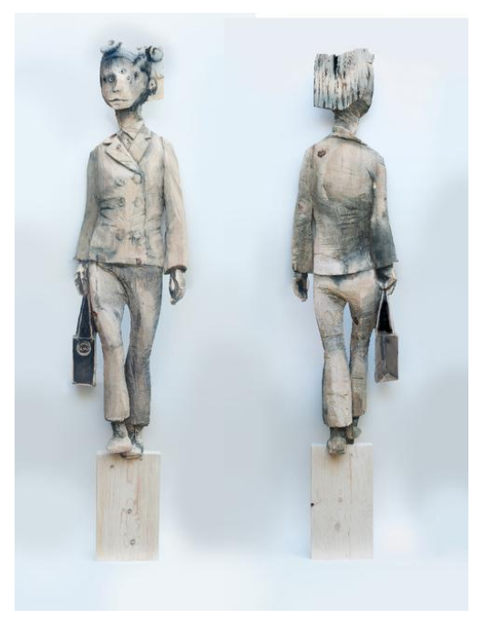
You will never be a real... 1 Watercolor on Spruce 63 x 13 3/8 x 1 3/4 in. (160.00 x 34.00 x 4.50 cm)