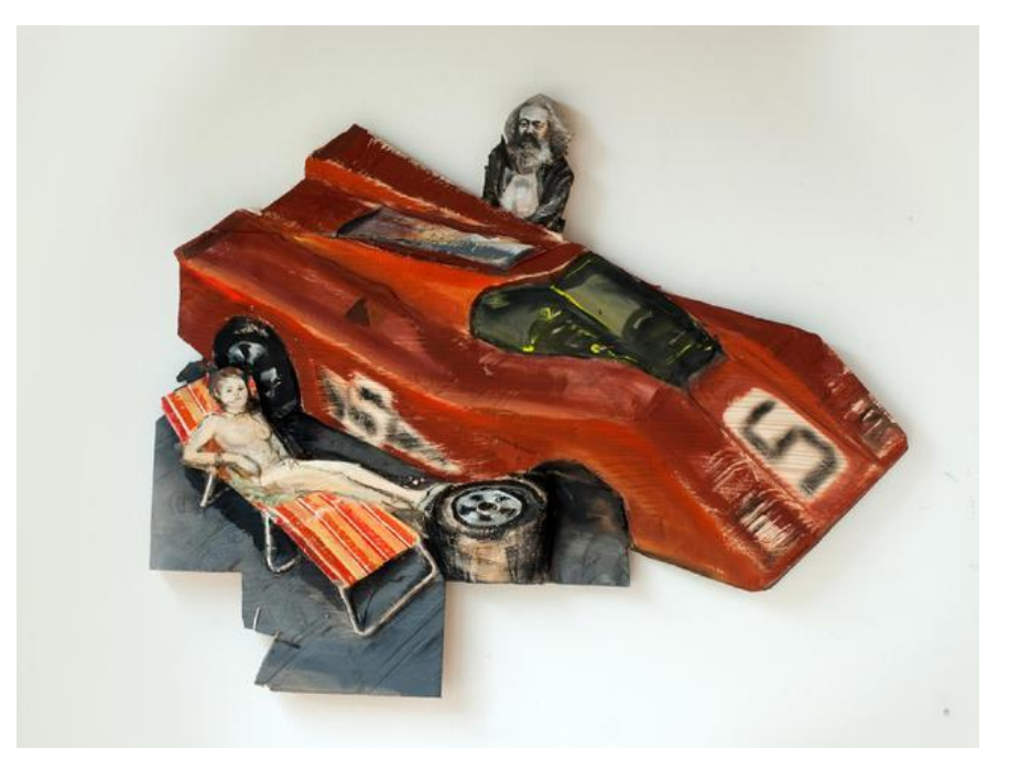
The camping incident

Oil on acrylic on spruce 35 x 28 1/3 x 2 in. (89.00 x 72.00 x 5.00 cm)