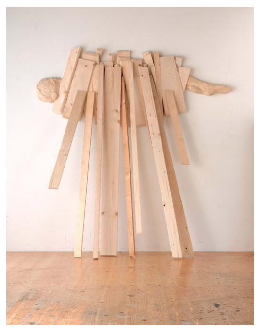
The roof Watercolor on spruce 66 1/2 x 68 1/2 x 21 2/3 in. (169.00 x 174.00 x 55.00 cm)