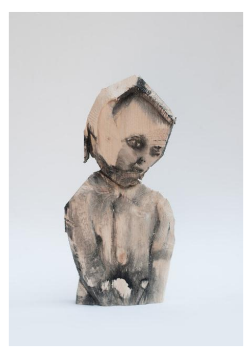
Spruced up (B) Watercolor on spruce 16 7/8 x 7 7/8 x 1 4/7 in. (43.00 x 20.00 x 4.00 cm)