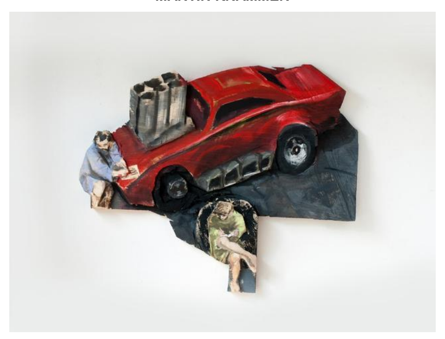
Los Michael Angeles Buonarroti Oil on acrylic on spruce 28 x 23 1/4 x 2 in. (71.00 x 59.00 x 5.00 cm)

Description In this case Michelangelo was the model for the Greek