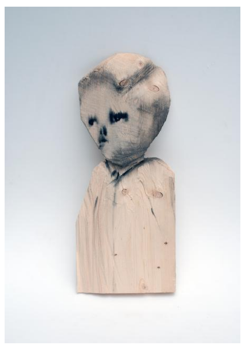
Spruced up (A) Watercolor on spruce 16 7/8 x 7 7/8 x 1 4/7 in. (43.00 x 20.00 x 4.00 cm)