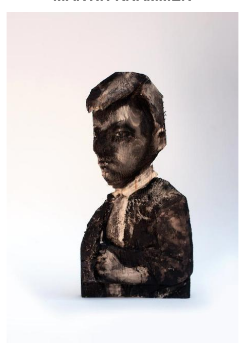
Spruced up (C) 16 7/8 x 7 7/8 x 1 4/7 in. (43.00 x 20.00 x 4.00 cm)