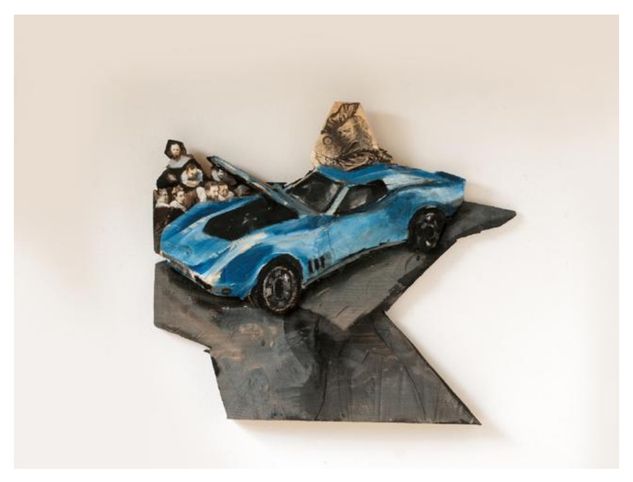
Rembrandt and his little blu corvette

Oil on acrylic on spruce 24 2/5 x 20 7/8 x 2 in. (62.00 x 53.00 x 5.00 cm)