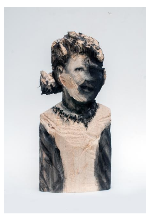
Spruced up (F) Watercolor on spruce 16 7/8 x 7 7/8 x 1 4/7 in. (43.00 x 20.00 x 4.00 cm)