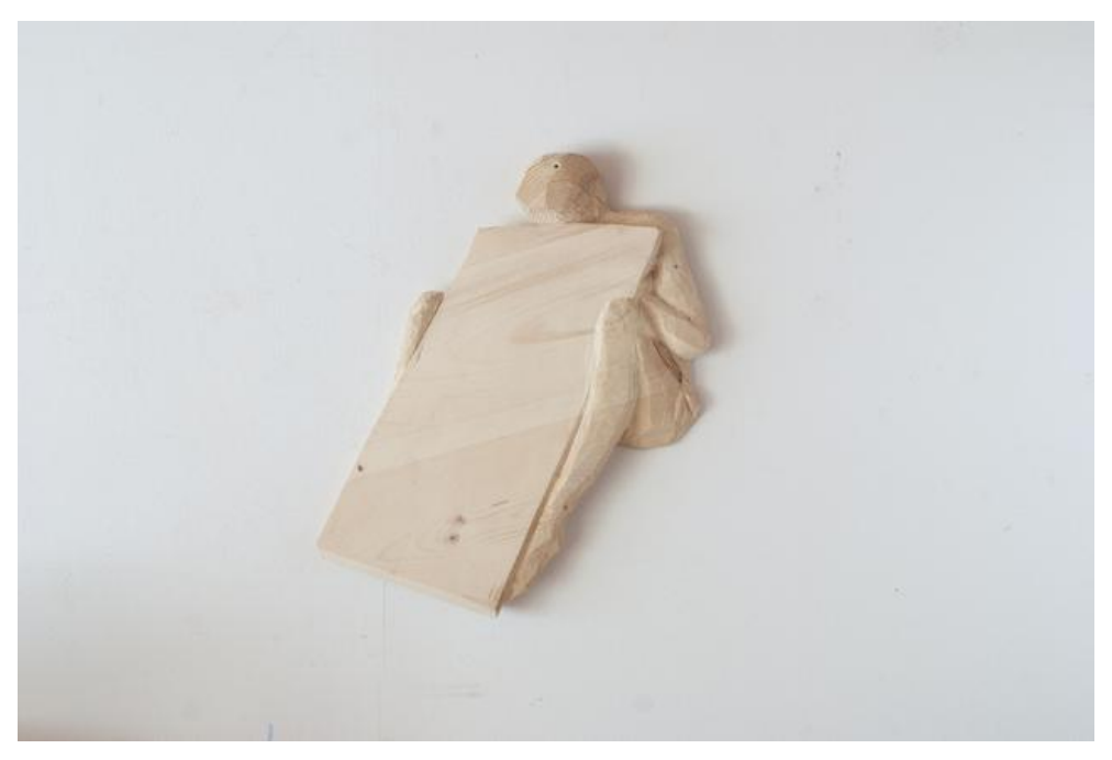
The ramp Spruce 21 1/4 x 17 5/7 x 2 in. (54.00 x 45.00 x 5.00 cm)