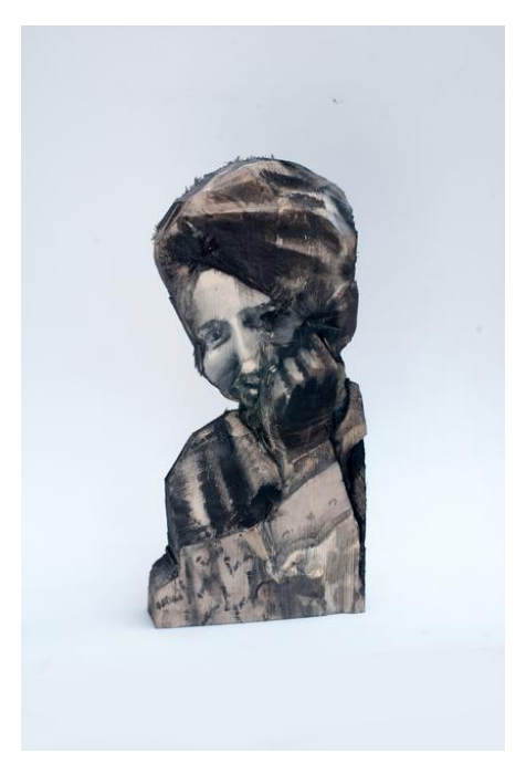
Spruced up (E) Watercolor on spruce 16 7/8 x 7 7/8 x 1 4/7 in. (43.00 x 20.00 x 4.00 cm)