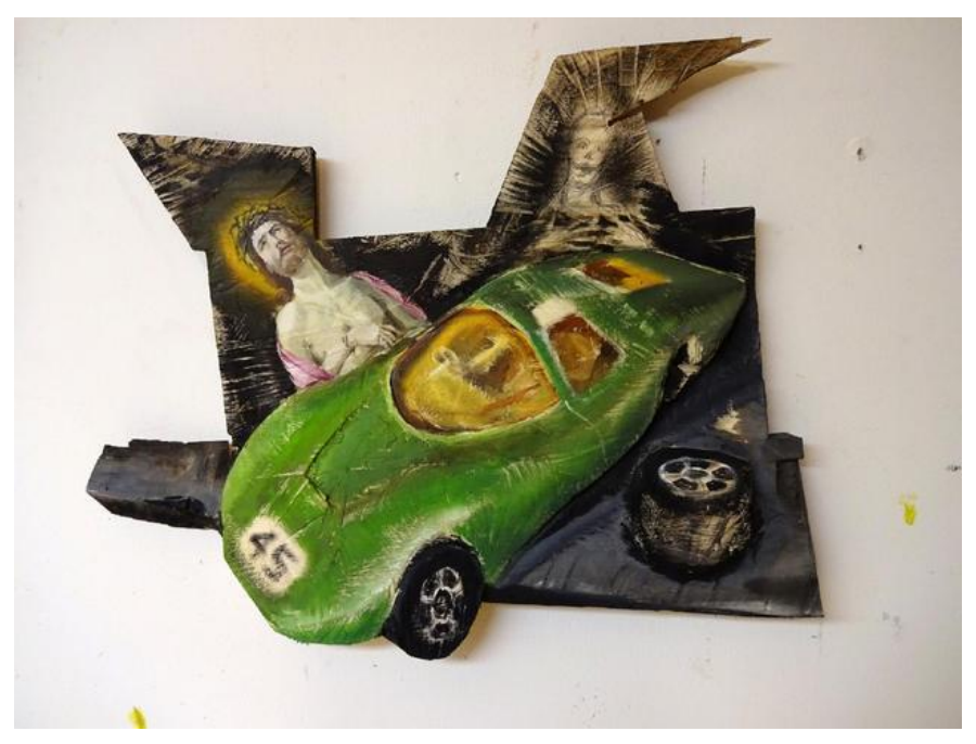
Rolling Reni Oil on acrylic on spruce 24 2/5 x 20 1/2 x 2 in. (62.00 x 52.00 x 5.00 cm)

Description Refers to the famous bolognese baroque artist Guido Reni and